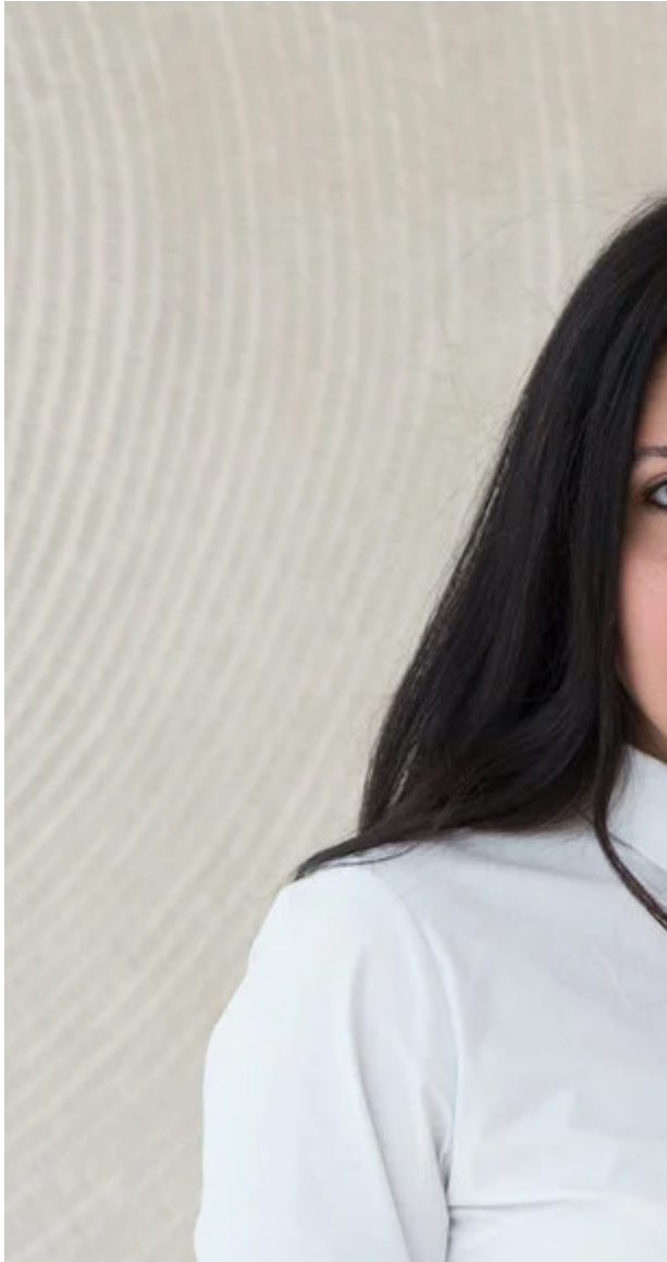
The artist's egg-shaped artwork is on show at Gale